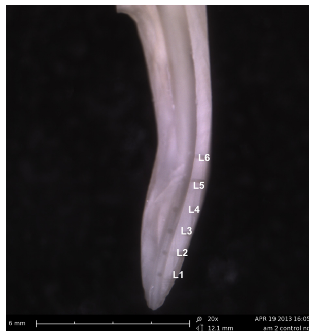
Figure 1. Round indentations created on the apical third at 1-mm intervals.

The specimens were immersed in an ultrasonic bath containing 5.25% sodium hypochlorite (NaOCl) solution for 3 minutes and then